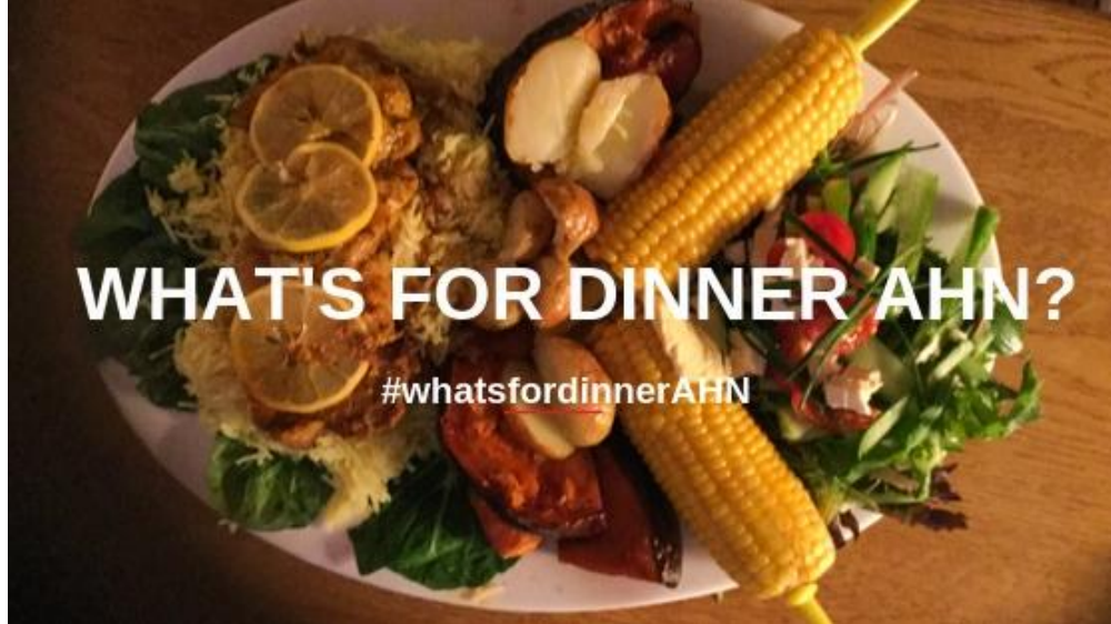
Student meal image provided by Annette - Brisbane

Have you got a fail-proof recipe to knock the socks off any international visitor? We want to know about it! Email us your most popular dish here and be sure to include your name, city, recipe details and a clear photo of the meal. Feel free to also send through an extra pic of your family enjoying said meal to make our mouths water even more.